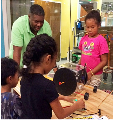
A family group collaborates on their invention.

Spark!Lab's project-based challenge approach invites visitors to invent around everyday themes, such as "Things That Roll" or "Things That Help Us See." The themes and respective invention challenges provide inspiration, but visitors can identify the problem they want to solve and, from the very first step of Think It!, they begin to brainstorm their own solutions. For example, within the "Things That Roll" theme, visitors might design an adaptive vehicle, invent a new kind of skateboard, or figure out a faster way to cut cookies. Other project examples include challenges to Reinvent the Shopping Cart and Invent a Device that can Move Through a Pipe . When visitors are personally involved in selecting the problems they want to address, they're more engaged, more passionate, more empathetic toward the end user, and more likely to persist through challenges and frustration.