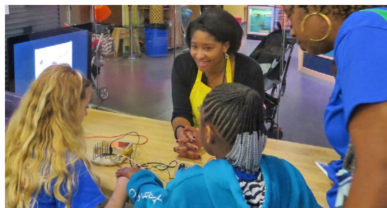
Spark!Lab facilitators use inquiry-based prompts to help visitors practice inventive skills.

Spark!Lab, launched in 2008 and located within the Smithsonian’s National Museum of American History (NMAH) in Washington DC, is a hands-on invention studio where children and their caregivers create, collaborate, explore, test, experiment, and invent. Designed around rotating themes that connect to NMAH’s collections and exhibitions, Spark!Lab’s invention challenges incorporate traditional science, technology, engineering, and math (STEM) with art, history design, culture, and creativity. Spark!Lab invites visitors to become inventors by actually experiencing the inventive process: